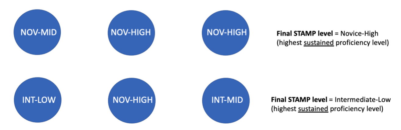
Figure 1. System rules for arriving at an examinee's final STAMP level for the Writing and Speaking sections

BASED ON RESPONSES TO 3 INDEPENDENT PROMPTS